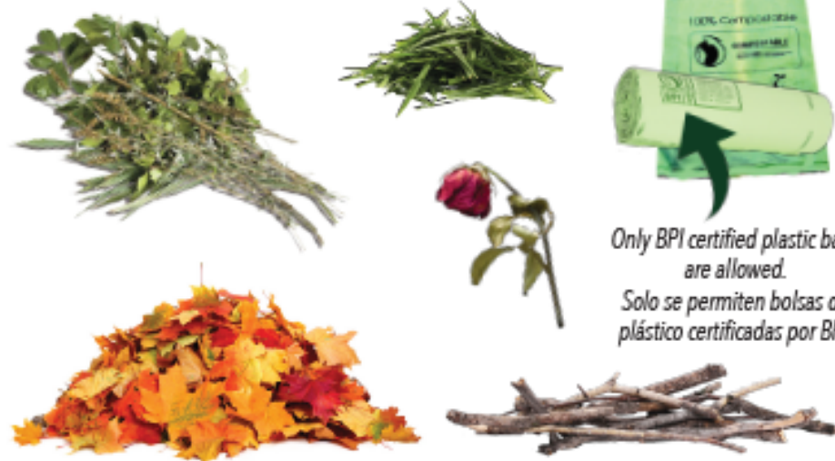
Plant Trimmings Plantas