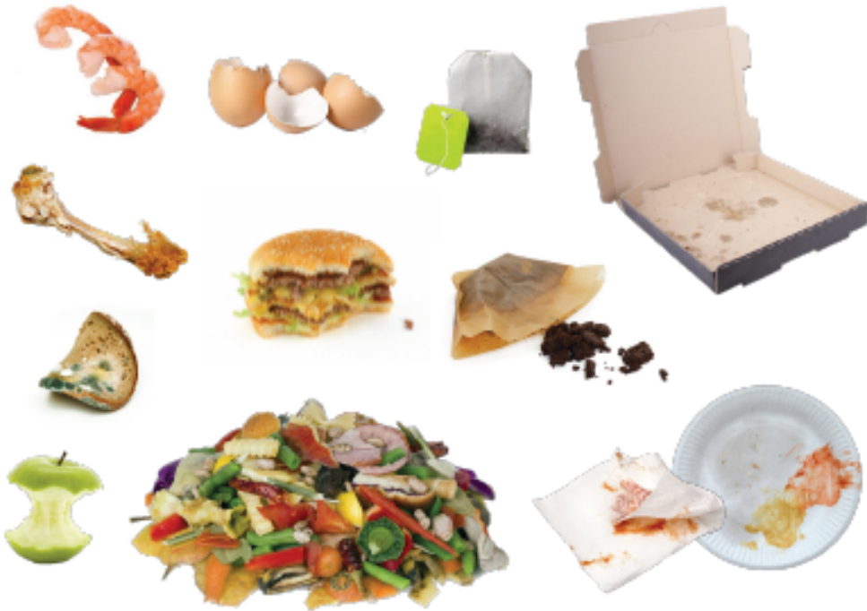
Food Scraps & Food-Soiled Paper Restos de Comida y Papel Sucio con Restos