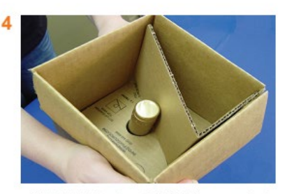
Slide folded top insert (WS01T) over neck of bottle with flap up and writing visible from top of box.