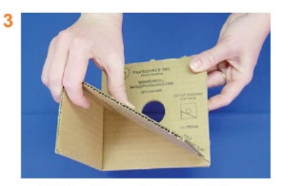
Fold flap & line up flap with black line on top of insert.