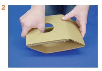
Pop open bottom insert and place in bottom of box. Place bottom of bottle into insert once it is in the box.