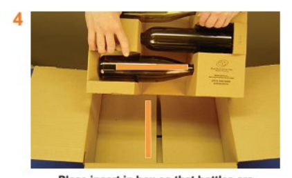
Place insert in box so that bottles are perpendicular to inner seam of box.