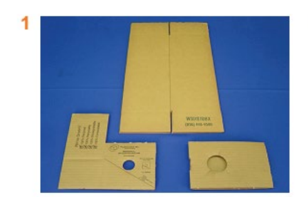
1 x 750ml WineShield™